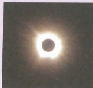
Fig. 1.2: A total solar eclipse

A commonly circulated claim is that, "Food should not be eaten during an eclipse because it becomes harmful". Disproof comes from asking simple scientific questions. An eclipse is just a play of shadows (Fig. 1.2). What physical change occurs during an eclipse? Does temperature change significantly? Does food go bad if it is left in a shadow? You will conclude that no physical, chemical, or biological mechanism supports such a claim.