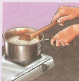
Fig. 1.3: Rice being cooked on a gas stove

To make a rough estimate, assume that all their calorie needs come from rice alone (Fig. 1.3). An average adult needs about 2000 – 2500 kilocalories (kcal) per day. Find out how many calories 100 g of uncooked rice provides when cooked and use this to estimate the daily requirement for the family. The aim is not to get an exact number, but to check whether the answer makes sense as 100 g for a month is clearly too little, while a few tonnes is far too much. Such estimation helps connect science to everyday questions about food and resources, and shows why approximate reasoning is an important scientific skill.