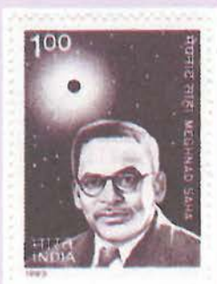
Meghnad Saha on an Indian postage stamp