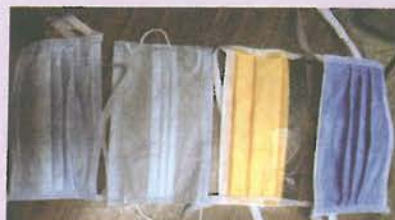
Fig. 1.4: A collection of surgical masks

Solving real problems requires knowledge from several branches of science. During the COVID-19 pandemic, we all used masks for safety (Fig. 1.4). Understanding how a mask works requires concepts from physics (particle motion and electrostatic attraction), chemistry (properties of polymer fibres), biology (size and behaviour of viruses), and mathematics (modelling airflow and filtration efficiency).