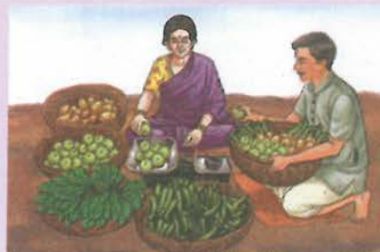
Fig. 1.1: A vegetable seller using a pan balance

When we buy rice or vegetables we expect a kilogram to mean the same amount everywhere (Fig. 1.1). Imagine the confusion if we used different weights everywhere! Thankfully, measurements are based on agreed international standards, not local objects or opinions. Standard units allow scientific results to be compared, and ensure fairness in daily life and trade.