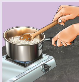
Fig. 1.3: Rice being cooked on a gas stove

To make a rough estimate, assume that all their calorie needs come from rice alone (Fig. 1.3). An average adult needs about 2000 – 2500 kilocalories (kcal) per day. Find out how many calories 100 g of uncooked rice provides when cooked and use this to estimate the daily requirement for the family. The aim is not to get an exact number, but to check whether the answer makes sense as 100 g for a month is clearly too little, while a few tonnes is far too much. Such estimation helps connect science to everyday questions about food and resources, and shows why approximate reasoning is an important scientific skill.