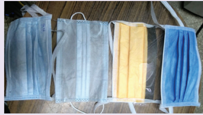
Fig. 1.4: A collection of surgical masks

Solving real problems requires knowledge from several branches of science. During the COVID-19 pandemic, we all used masks for safety (Fig. 1.4). Understanding how a mask works requires concepts from physics (particle motion and electrostatic attraction), chemistry (properties of polymer fibres), biology (size and behaviour of viruses), and mathematics (modelling airflow and filtration efficiency).