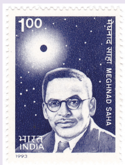
Meghnad Saha on an Indian postage stamp

Simplifying the stars: Science often begins by ignoring details. When physicist Meghnad Saha studied the light from stars, he did not try to model every atom, every reaction, or every movement inside a star. Instead, he treated the matter in the star as a hot gas, ignored many complex processes, and focused only on temperature, pressure, and how atoms formed ions. This simplification allowed him to explain how the colour of stars is deeply connected to their temperature.